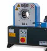
S 3 L Ecoline