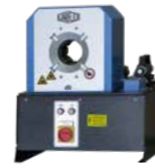
S 3 Ecoline

We reserve the right to make technical changes without notice. Options are machine parts that can only be ordered while buying the machine.