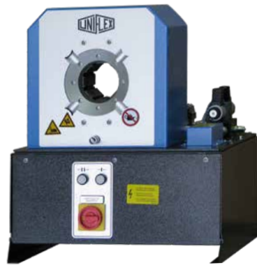
S 3 Ecoline

Due to its narrow and innovative construction, high level of user friendliness and long service life, the S 3 sets new standards for quality and cost effectiveness. Its compact construction allows for ergonomic working. The use of long master dies allows you to crimp 90° elbow fittings up to 1¼" with the tried and tested greaseless slide bearing technology, which reduces maintenance costs and increases the product quality.