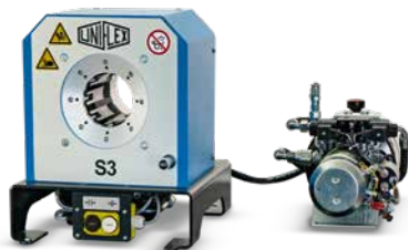
S 3 L Mobileline (131 kg) With die package (148 kg)