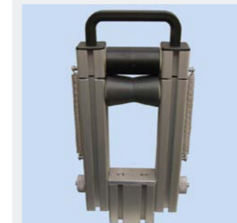
Hose feed guide UHG 325.3