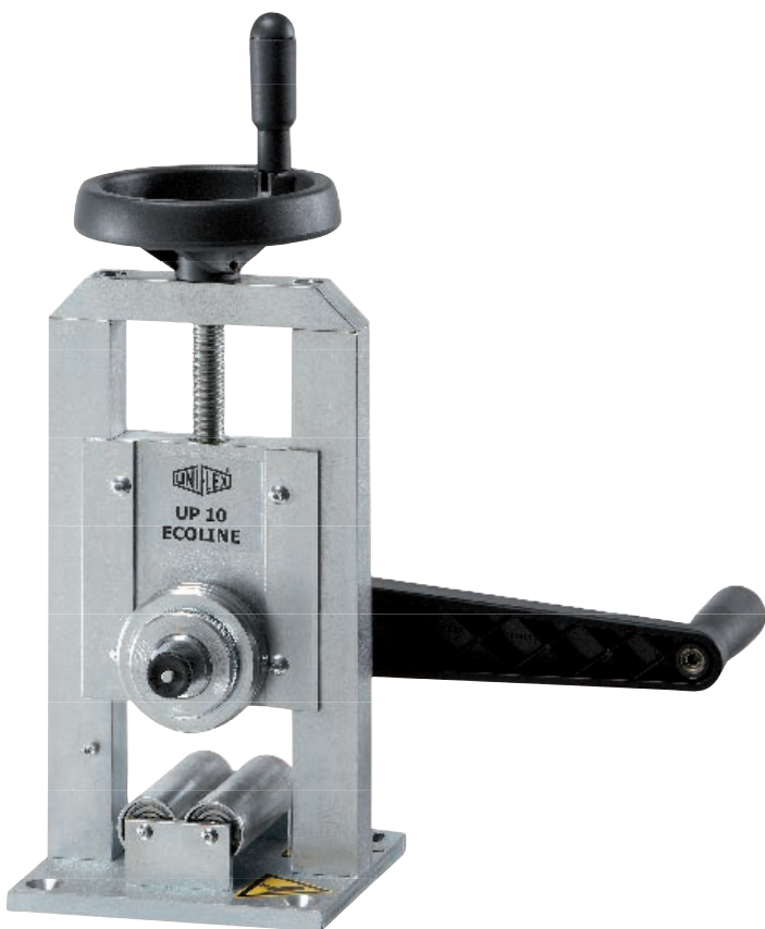
UP 10 Ecoline

The new and compact UNIFLEX marking tool UP 10 Ecoline will give you an exact and easy-to-handle tool. The robust technology and lowmaintenance makes it a perfect machine for mobile operations or workshops.