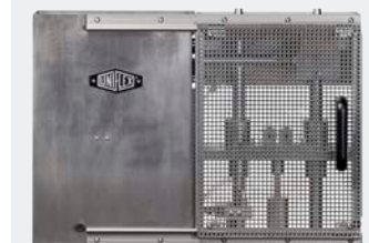
UP 115 closed