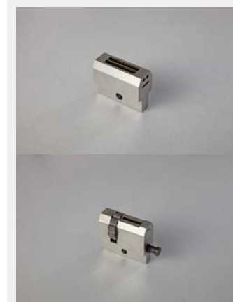
Type holder for the UP115