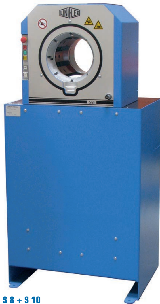
S 8 + S 10

Its compact construction allows for ergonomic working. The use of long master dies allows you to crimp 90° elbow fittings up to 2" with the tried and tested greaseless slide bearing technology, which reduces maintenance costs and increases the product quality.