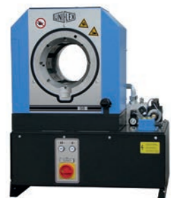
19 S 8 Ecoline + S 10 Ecoline