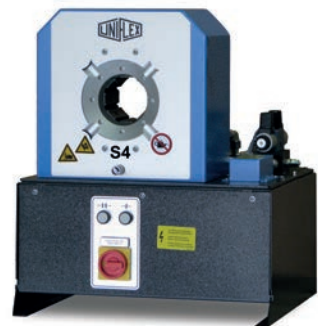
S 4 Ecoline