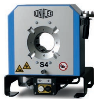
S 4 DC