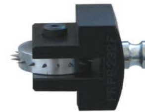
PR PB 232 F