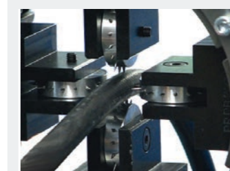
Constant prick depth