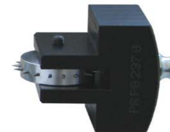
PR PB 237 G