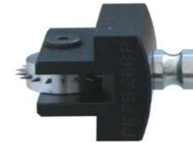
PB PR 266 P