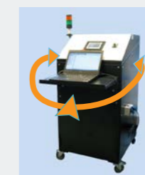
Swivelling notebook shelf