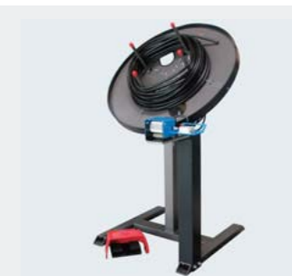
Hose coiling reel UWT 2 + Hose measuring tool UMS 4

Accessories and more information can be found on the this catalogue's jacket.