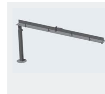
UHG 14 Hose guide

Guide for a perfect centration of hoses.